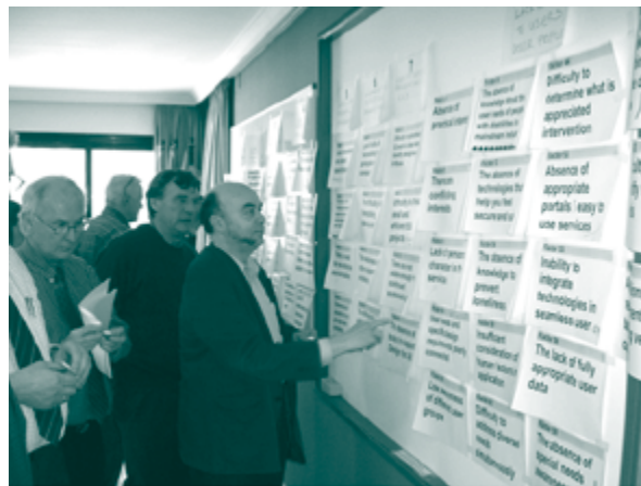
Figure 7.2 Participants engaged in the voting process.

Table 7.13 Prioritisation of Factors. The numbers in the left column correspond to the numbering performed for the coding of the proposed factors (i.e., same as in Table ). The middle column contains the number of votes cast for each element. Elements that received less than four votes were not used in subsequent phases. One element received 11 votes, one received 10 votes, two received 8 votes, one received 7, four received 6 votes, four received 5 votes and eleven elements received 4 votes each. A total of 24 elements were used to structure the influence map shown in figure 7.3, whereas the remaining 41 elements were not considered further.