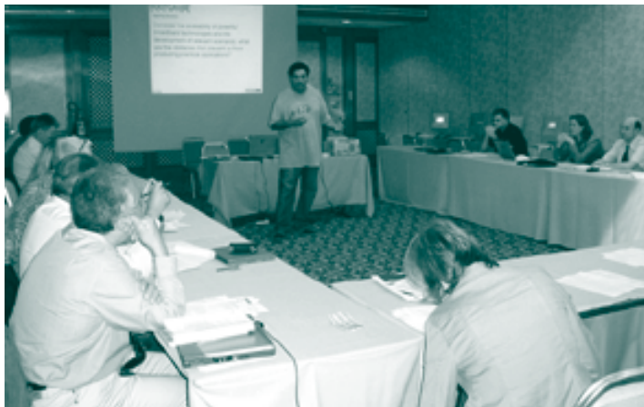
Figure 7.1 Set-up of the working space. The facilitator has easy eye contact with all participants. The co-facilitator (not visible; sitting opposite of the first) documents on the computer all contributions and manages projections using the beamer. Contributions are printed and posted on the surrounding walls. Access to the walls is easy and comfortable. Some Internet stations are available for participants to perform quick look ups of an issue and access information necessary for them to make educated decisions.